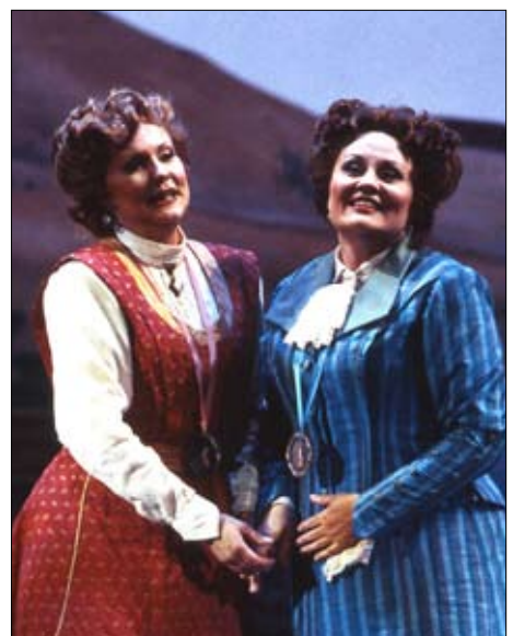
Scenes from The Atlanta Opera's 2000 production of Così fan tutte