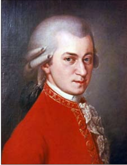
Wolfgang Amadeus Mozart

b. Salzburg, January 27, 1756; d. Vienna, December 5, 1791