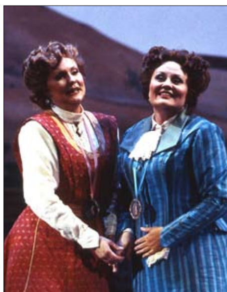
Scenes from The Atlanta Opera's 2000 production of Così fan tutte